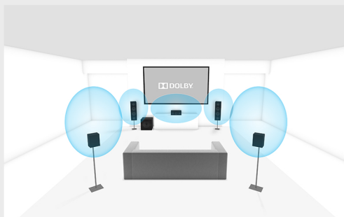
Perspective detail for 5.1 setup

This number refers to how many powered subwoofers you can connect to your receiver.